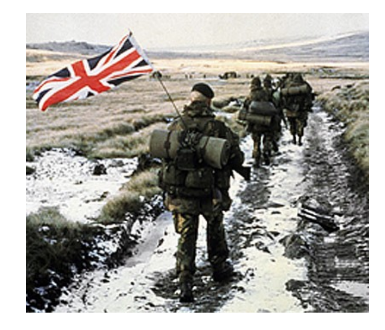
A column of 45 Royal Marine Commandos march towards Port Stanley.