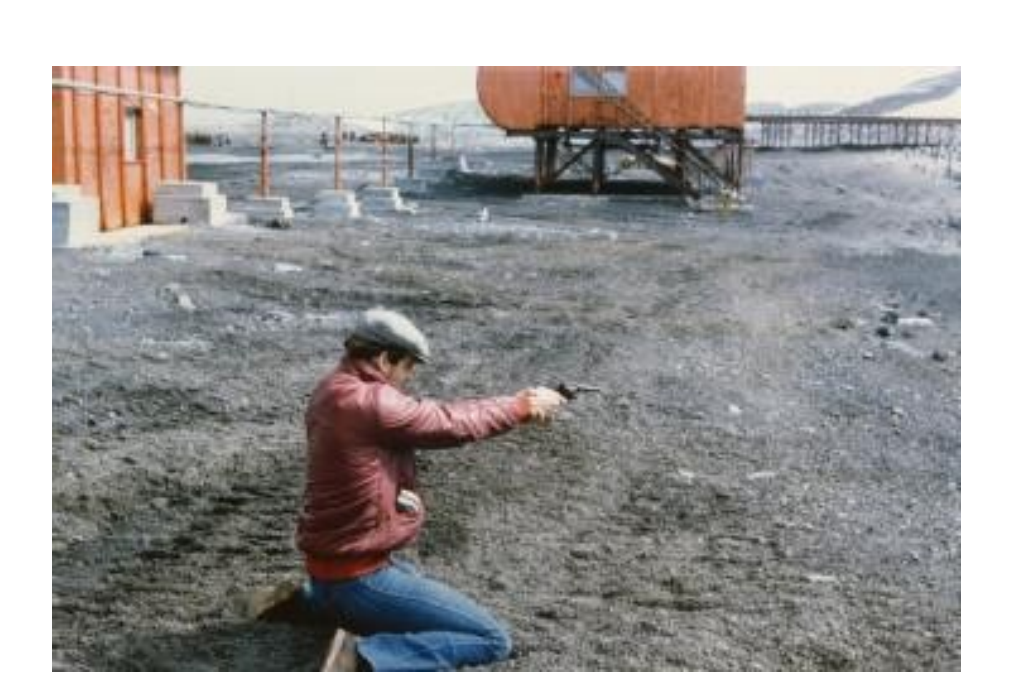
An Argentine scrap metal dealer on South Georgia in March 1982.

My thanks to the Royal British Legion for this information.