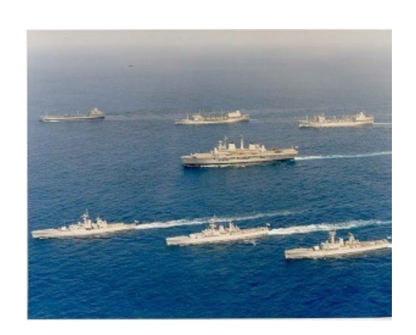
The Royal Navy Task Force sails south.