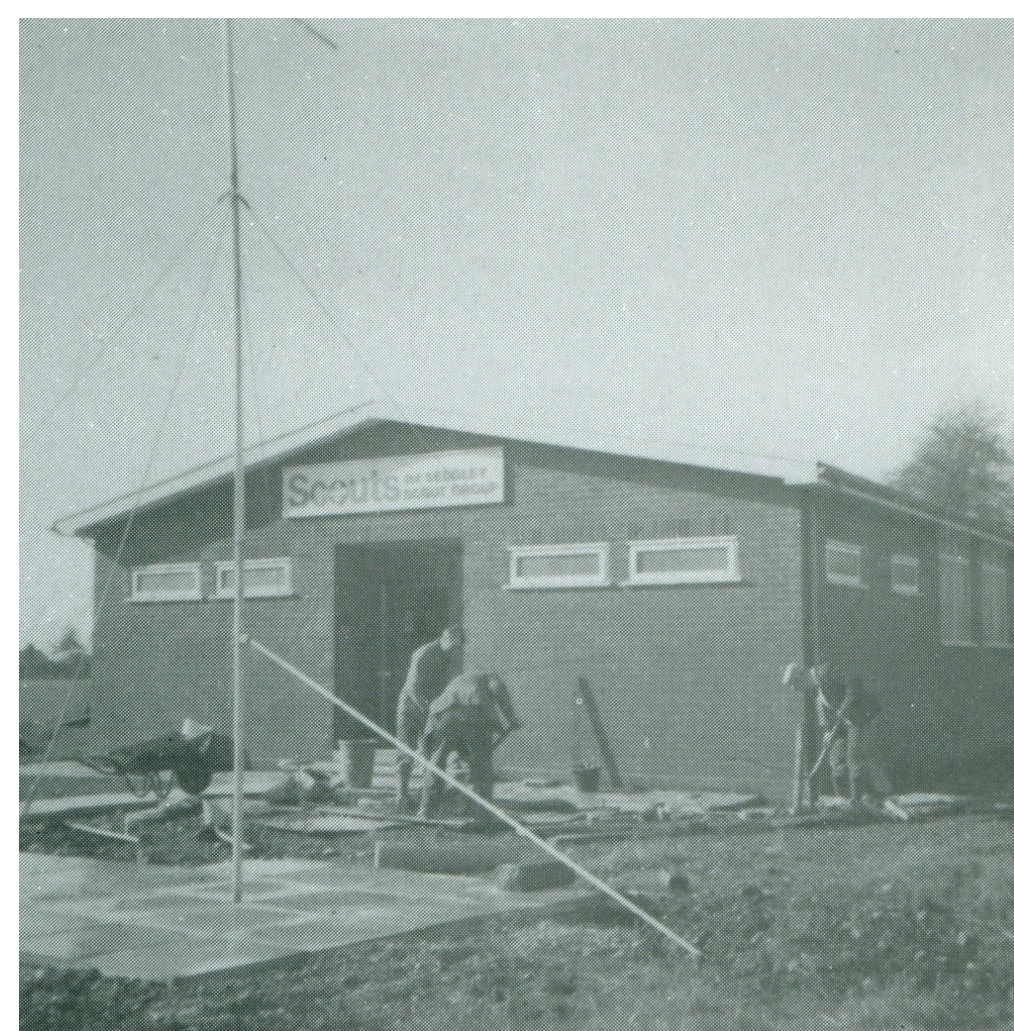
The 'Sunday Morning Club' work on the building