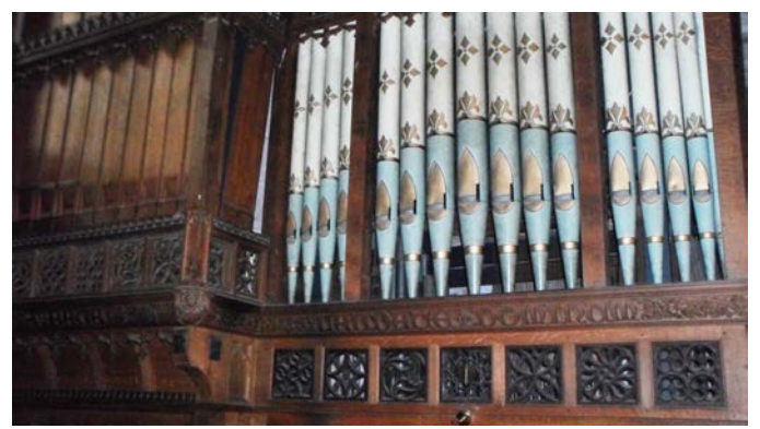
The organ was restored by Nicholsons of Worcester in 1897.