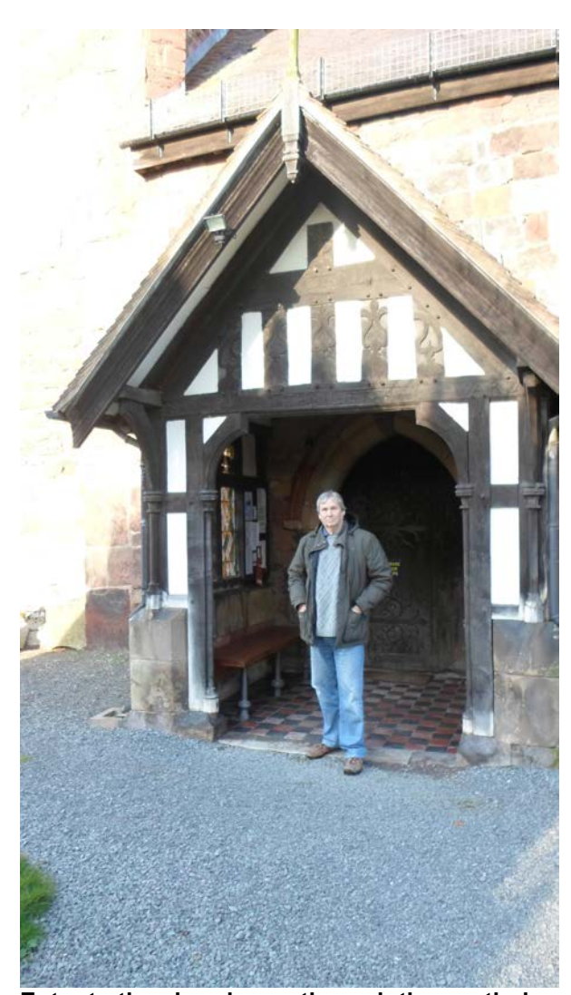
Entry to the church was through the south doorway.