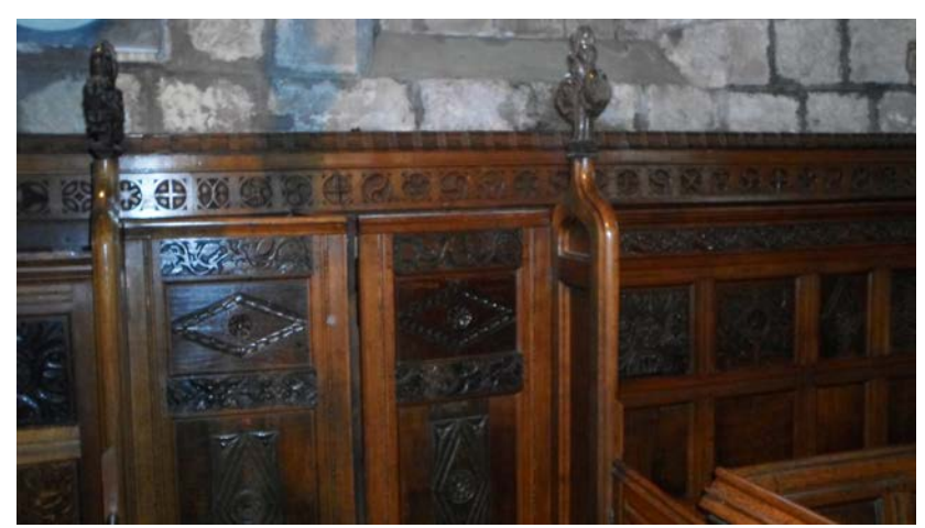
The choir stalls incorporate late medieval poppyheads and 17th-century reliefs.