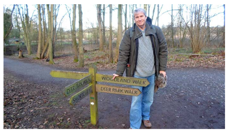
Signpost indicating paths through the woods.

We've visited Attingham Park , the regional HQ of the National Trust , many times, and it has the advantage of being one of the few local Trust properties that remain open over the winter.