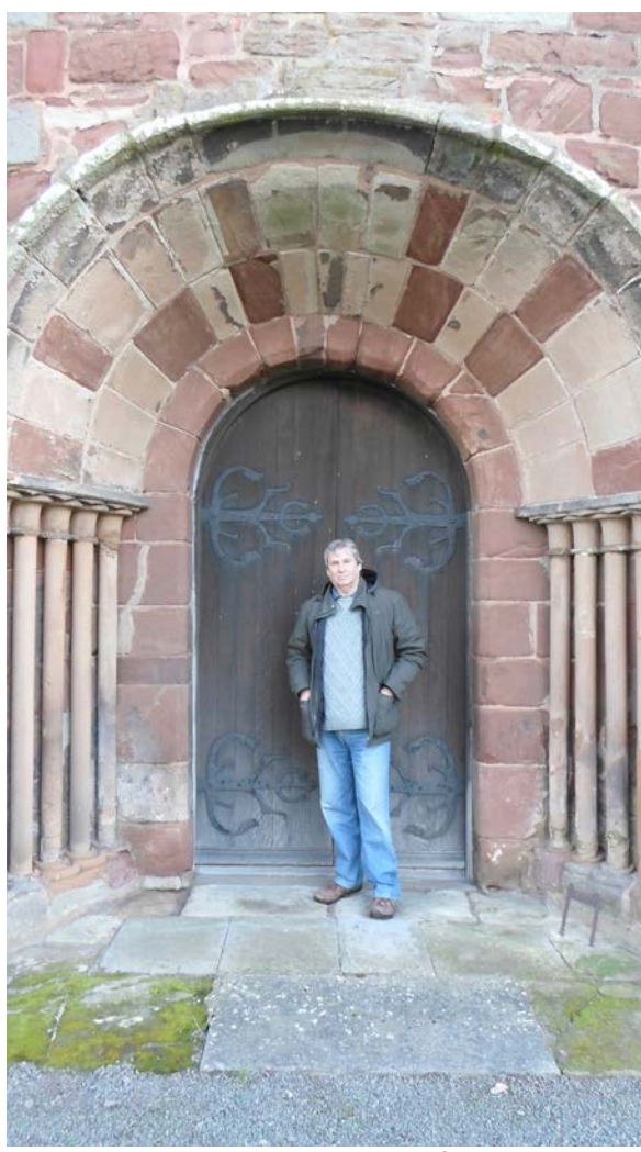
The east doorway wasn't used for access on our visit – it has an impressive oak door and Norman arch above.