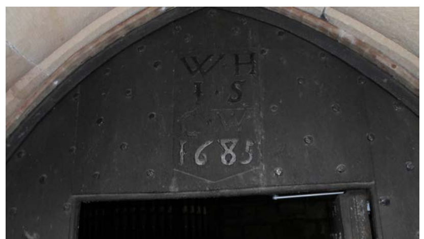
The inscription above the south door gives the date of construction as 1685.