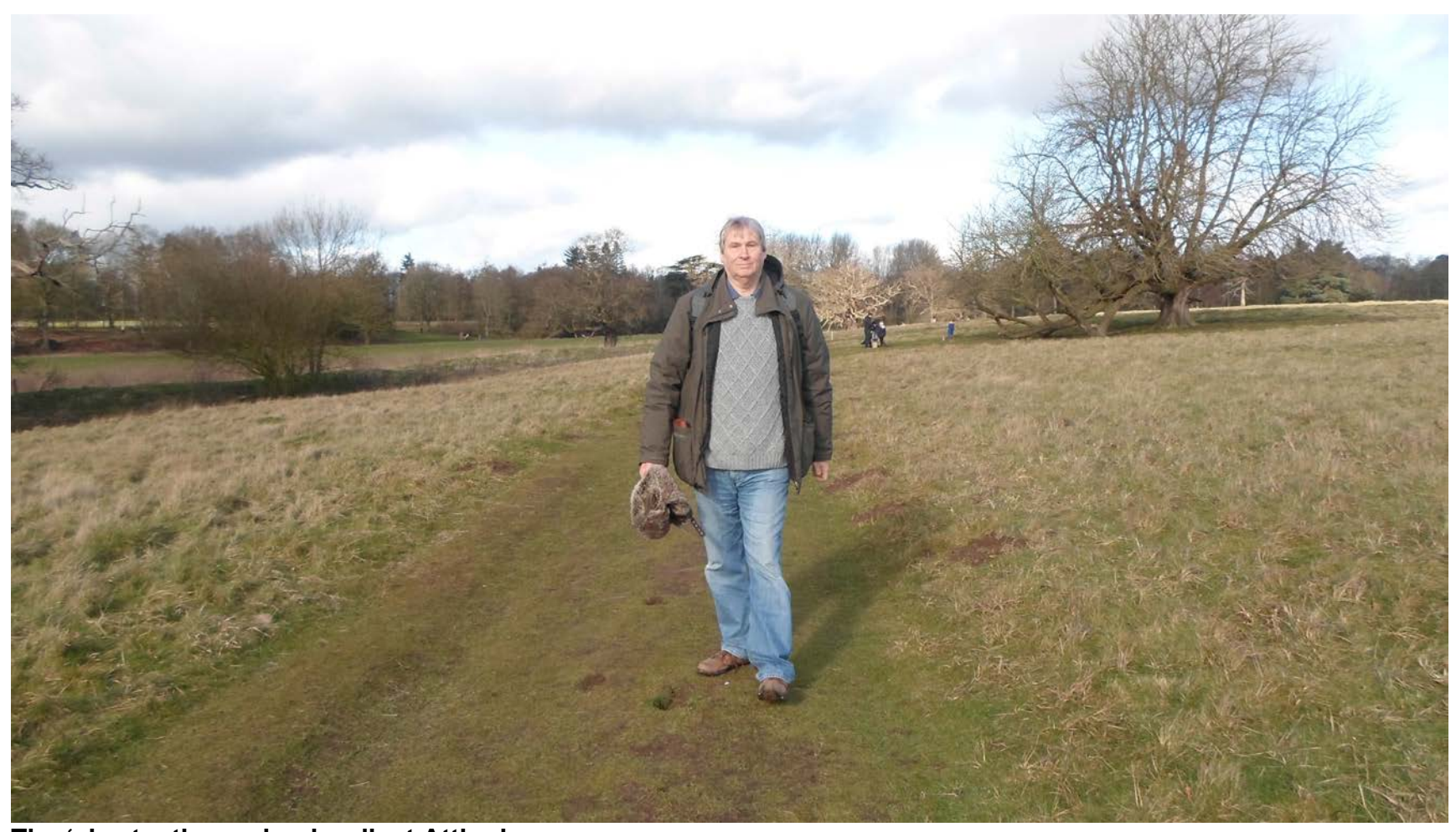
The 'shortcut' moorland walk at Attingham.