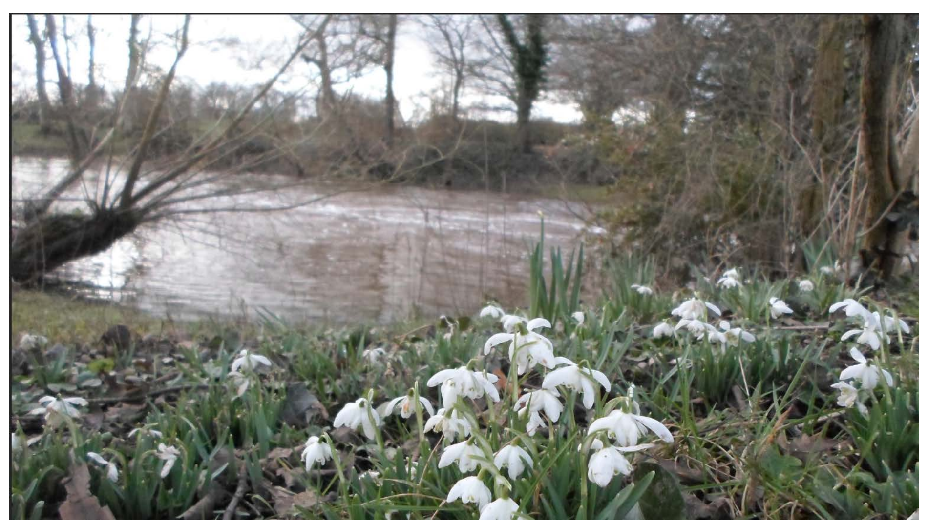
Snowdrops on the banks of the River Tern, by the weir at Attingham Park.