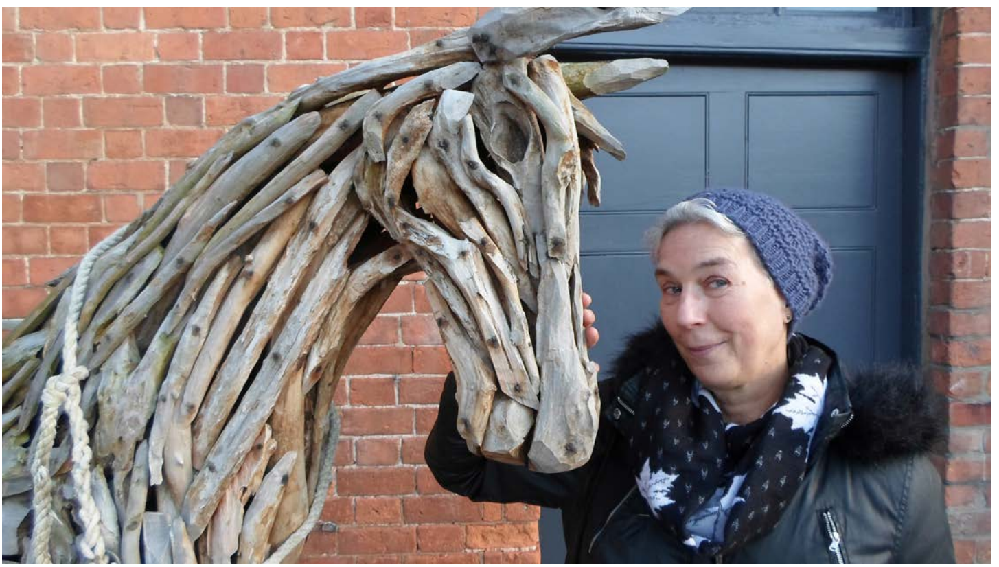
There are several life size sculptures of horses in the courtyard and in the stables at Attingham.