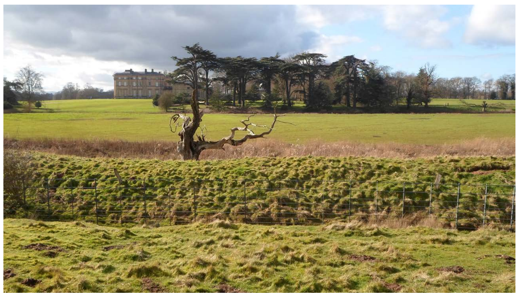
A distant view of Attingham Hall on the 'shortcut walk', February 2016