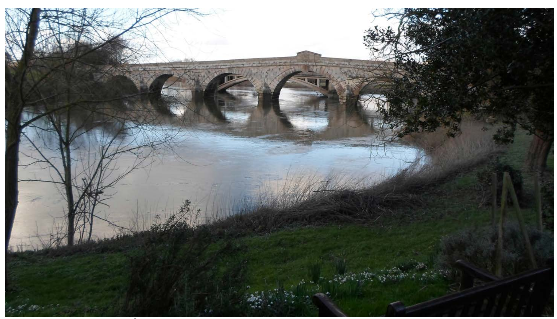
The bridge across the River Severn at Atcham.