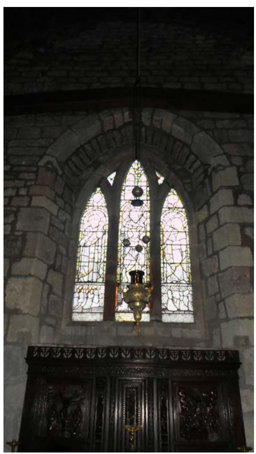
The stained glass in the east window dates from the 15th century - there is also a 16th-century glass in a north nave window depicting Blanche Parry, a personal attendant of Queen Elizabeth I.

In the north wall of the chancel is a window dated 1859 by William Wailes, and there are windows in the south walls of the chancel and the nave by Lavers and Westlake.