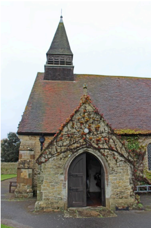
St Peter's Selsey.

Our final church in West Sussex, St Peter's Church Selsey dates from the 13th century. The Church building was originally situated at the location of St Wilfrid's first monastery and cathedral at Church Norton some 2 miles north of the present centre of population.