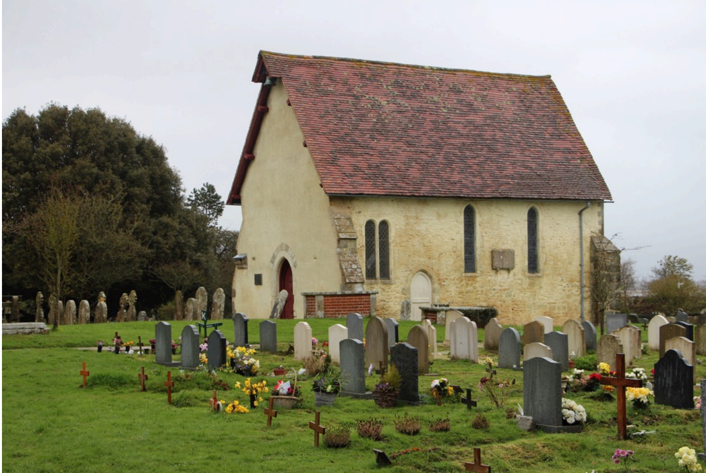
St Wilfrid's Chapel at Church Norton near Selsey. It is maintained by the Churches Conservation Trust.