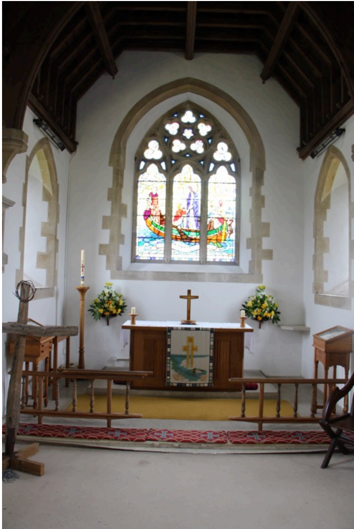
The beautiful chancel at Birdham.