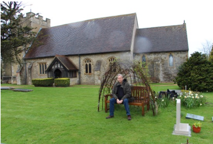
The Macrocarpa tree is located in a very pretty churchyard at Birdham, featuring a bench with trellis arch.

The first church we explored was St James', Birdham . The most striking feature outside the church was the Macrocarpa tree – it had the appearance of an ancient ash with a contorted knotted trunk. 'Hesperocyparis macrocarpa', commonly known as Monterey cypress , is a species of cypress native to the Central Coast of California - however the precise species is disputed and it may be an example of Italian Cypress ( C. sempervirens ). It was a nice surprise to find a variant on the ancient ash trees found in most old churchyards!