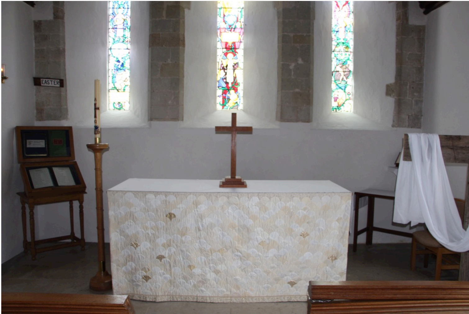
The altar at Itchenor.