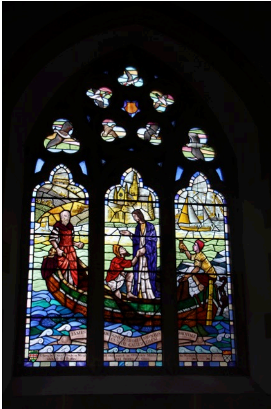
East window, St James', Birdham. The scene depicted is Mark I: 19:20 - 'When he had gone a little farther, he saw James son of Zebedee and his brother John in a boat, preparing their nets. 20 Without delay he called them, and they left their father Zebedee in the boat with the hired men and followed him.'