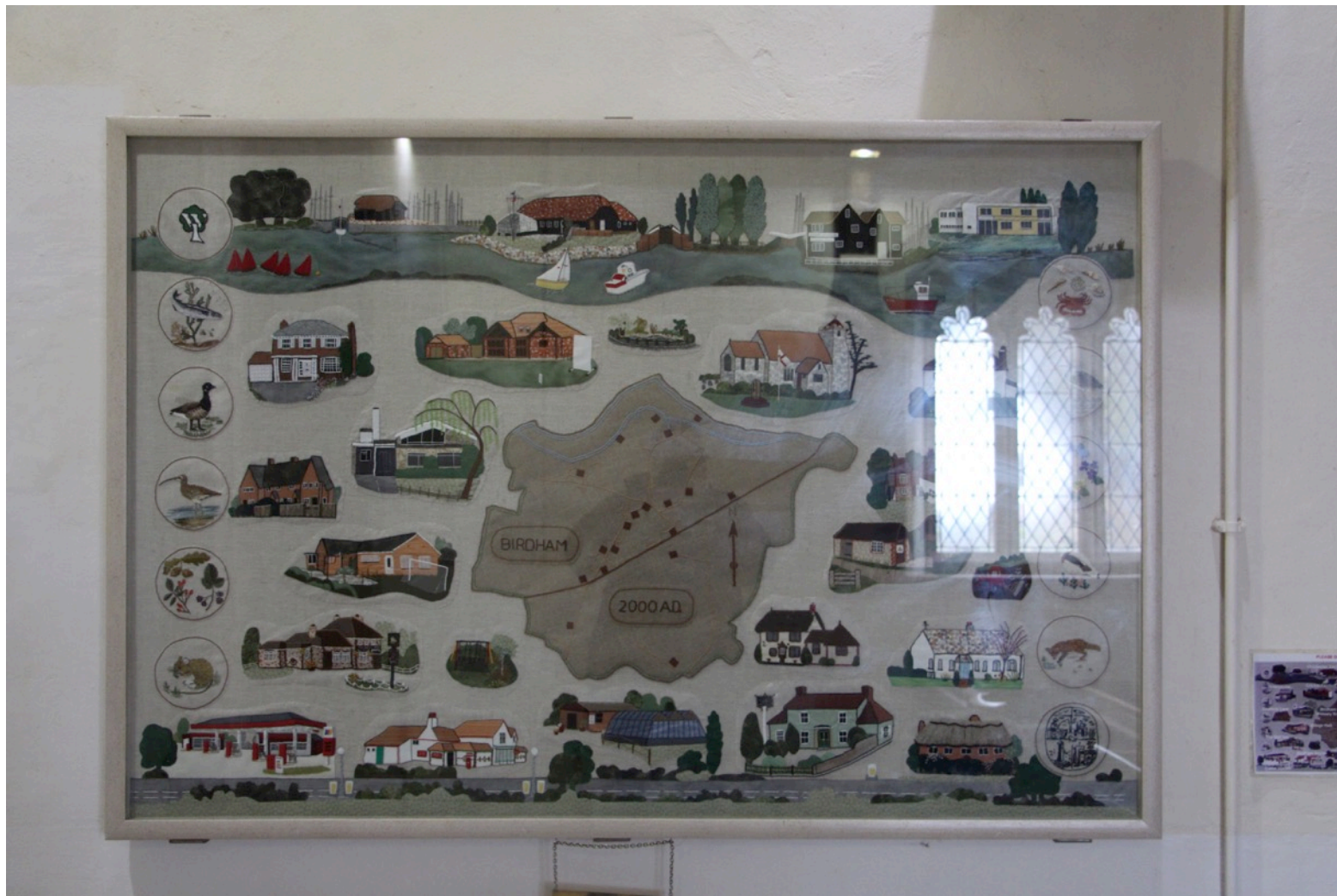
A Millennium embroidery project depicting the village and its buildings at Birdham.