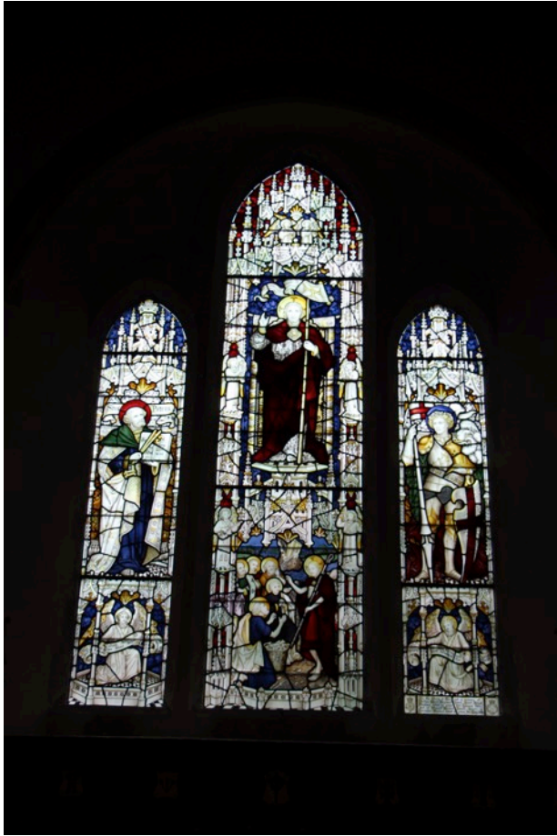
East Window, St Peter's Selsey.