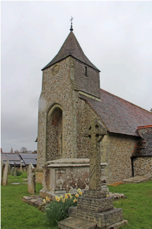
St Nicolas, Itchenor.

Our second church on Friday morning was the Parish Church of St Nicolas, Itchenor . It's a 13 th century single-cell church, with later windows. The unusual belfry dates from the extensive restoration in 1869.