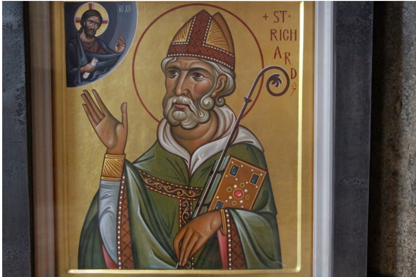
I had also missed the icon of St Richard at his shrine on my first visit.