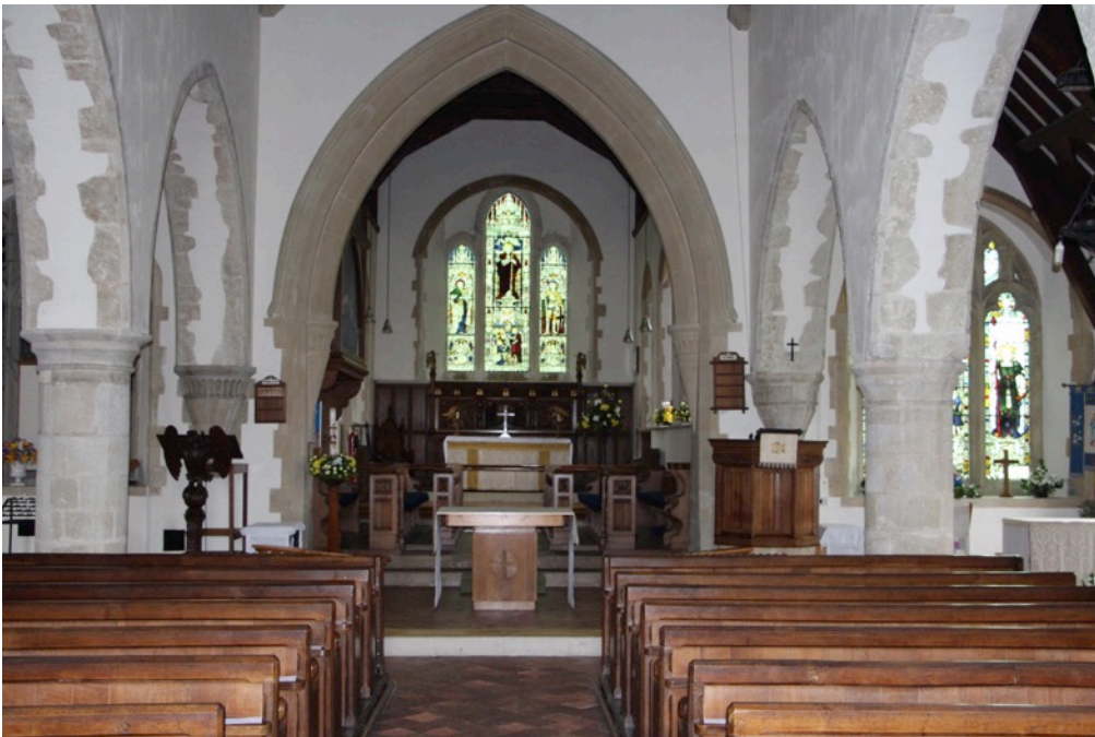
The nave and chancel at St Peter's, Selsey.

The location of the old Selsey cathedral is not known for certain, and although some local legends suggest it is under the sea, and that the bell could be heard tolling during rough weather, it is thought unlikely. A more likely explanation is that the replacement church, founded in the 13th century, was built on the site of the old cathedral. There it remained until 1864-66, when all but the chancel was moved to the new centre of population in Selsey, where it was orientated North rather than East. The chancel that remains at Church Norton was dedicated to St Wilfrid in 1917 and is known as St Wilfrid's Chapel. The new parish church, complete with a new chancel, was consecrated on 12 April 1866.