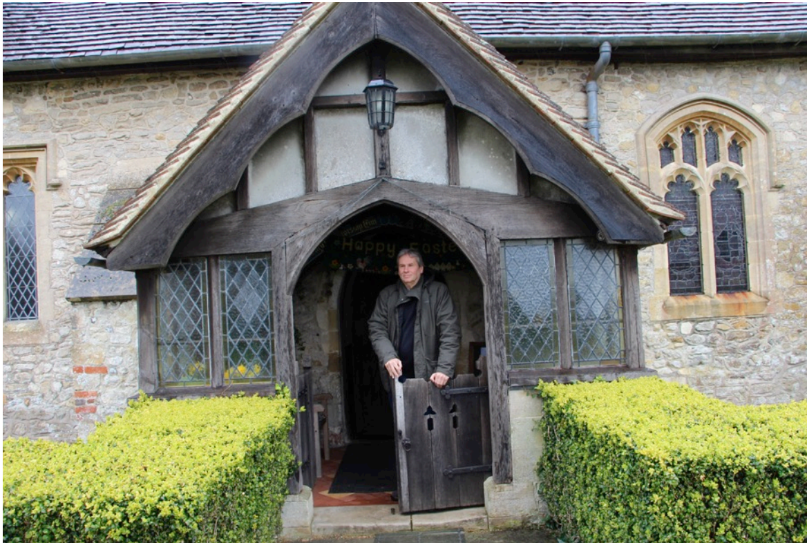
The gated porch at Birdham.

The parish church of St James, Birdham is situated on the Manhood Peninsula in Sussex. The area is a suburban extension of the city of Chichester, popular as a place to live and visit from its nearness to the city, Chichester Harbour and marina. The church was heavily restored in the nineteenth century, the then existing chancel being entirely replaced and the nave windows renewed. The sixteenth-century tower remains. The church has a Grade 1 listing.