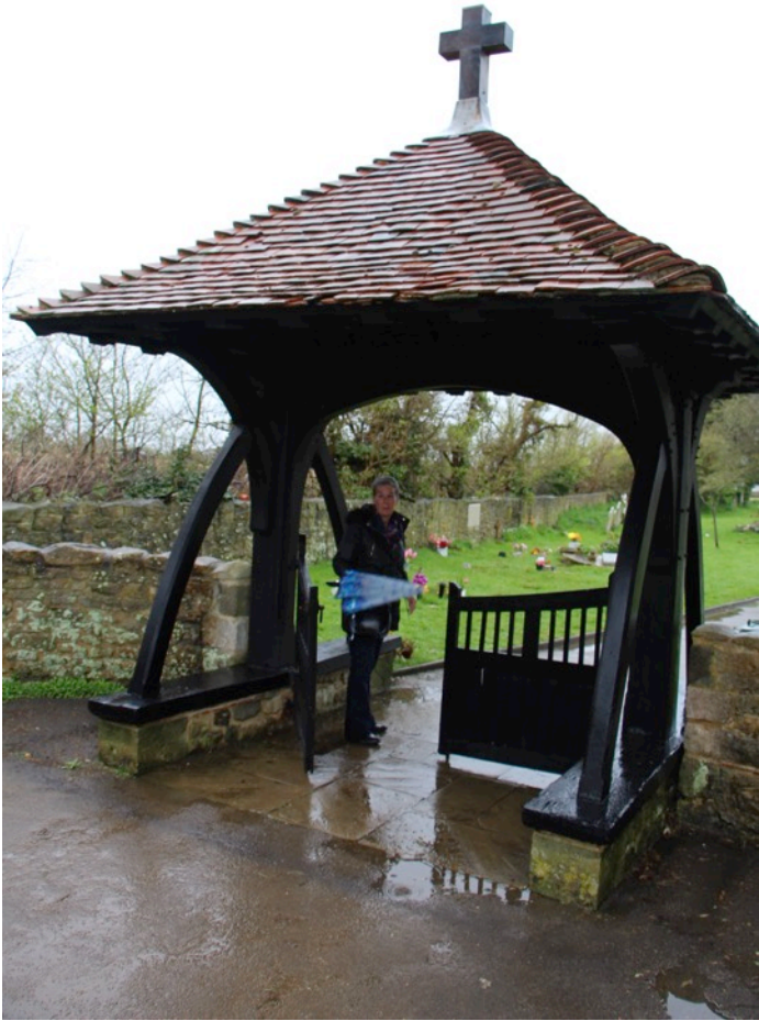
The lych gate at Church Norton.