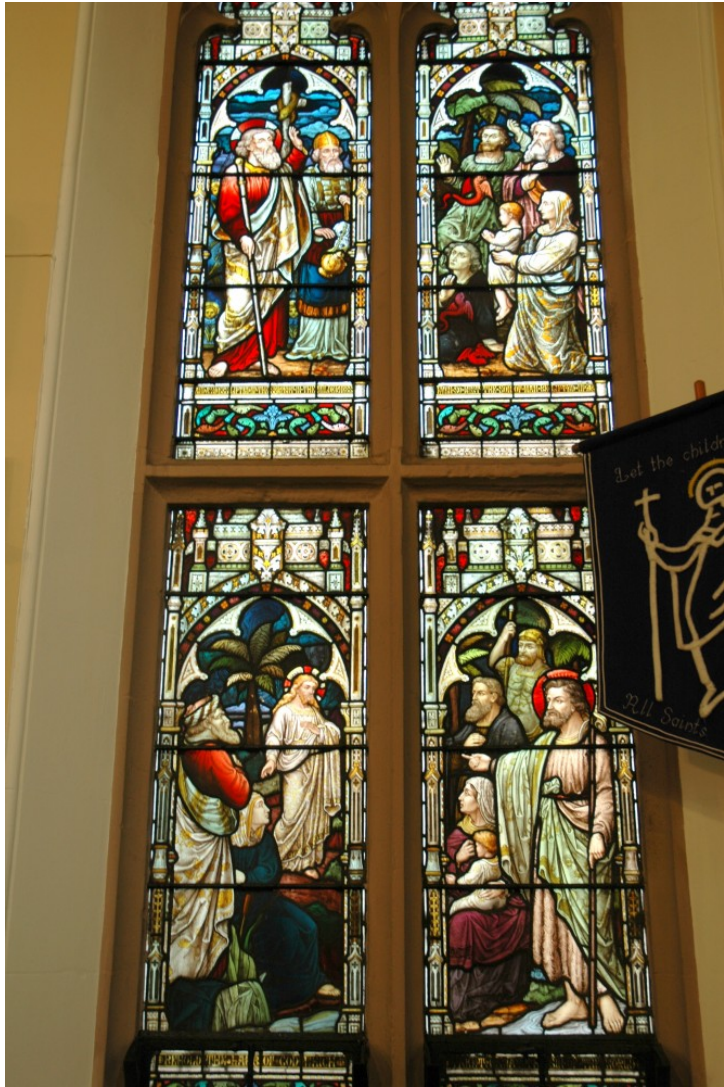
Shale window – North Wall