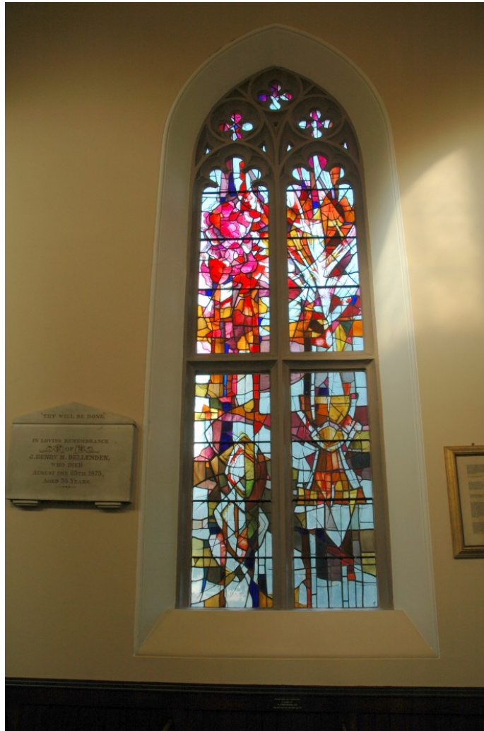
The Younger Window, North Wall.