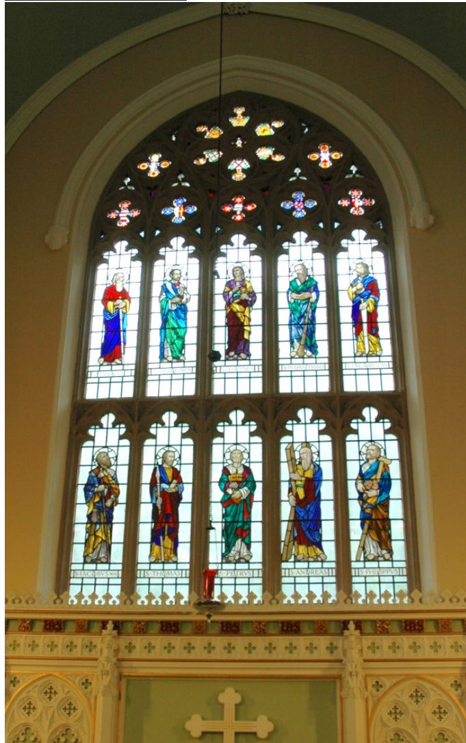
The East Window