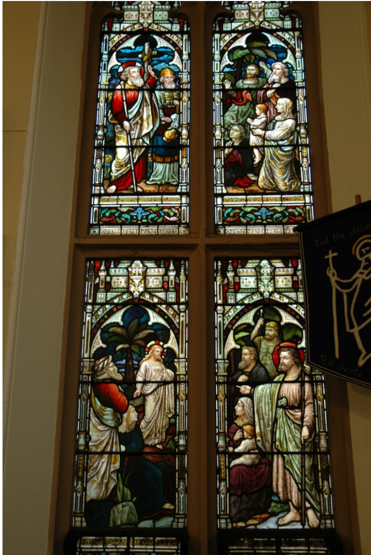
The full window