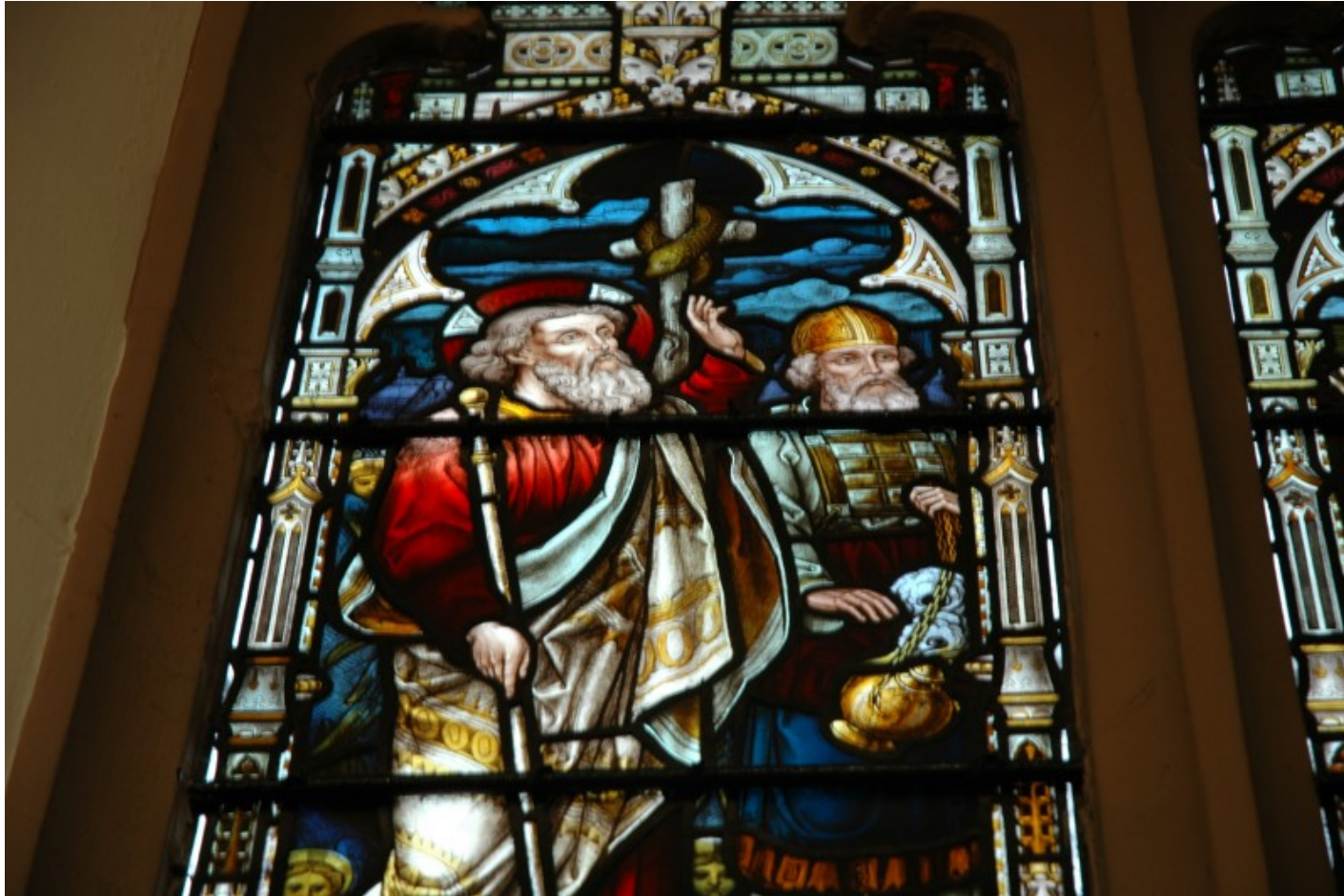
The upper left panel carries the following wording: John 3:14 - "And Moses lifted up the serpent in the wilderness"