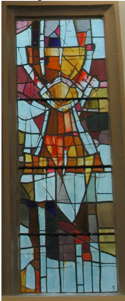
Lower right: WINTER