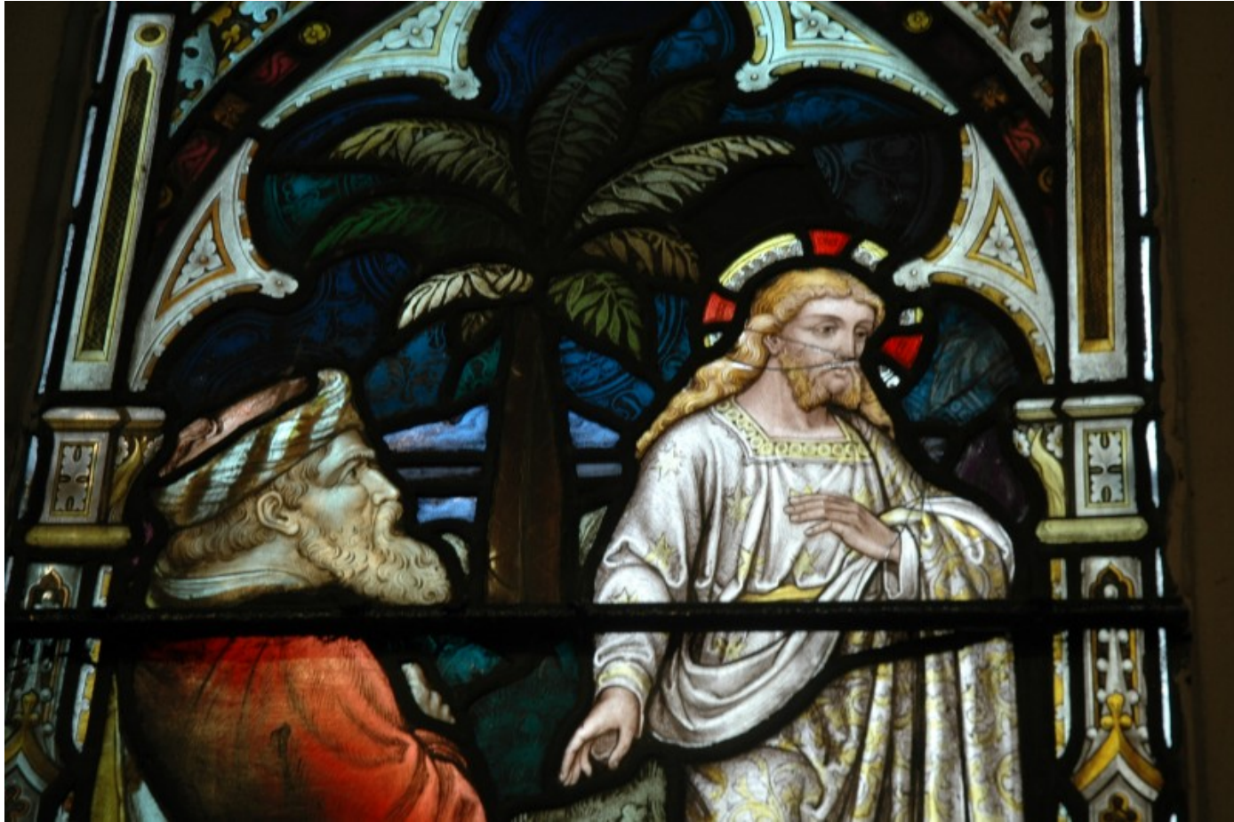
The left lower panel features Jesus, and the Bible quotation is also from John ( John 1:29 ) "Behold the Lamb of God..."