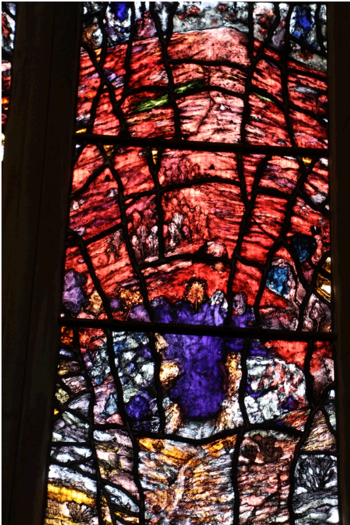
The landscapes are intended to evoke the landscape of the Malvern Hills.