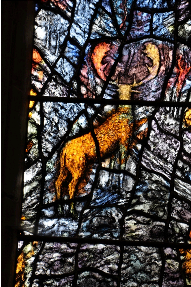
'You save humans and animals alike'