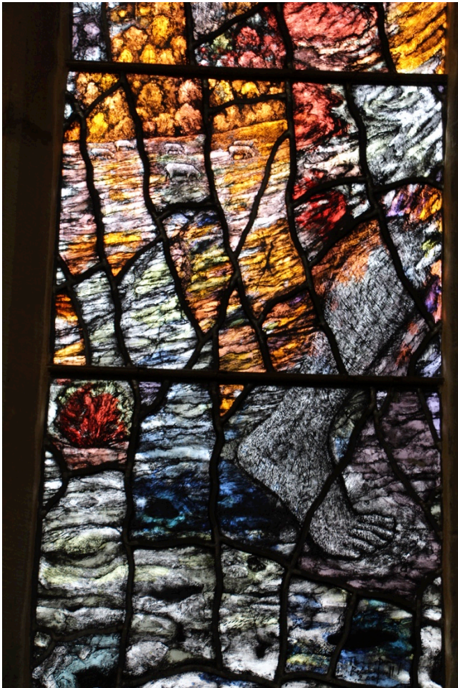
A figure moves out of view suggesting a passage from Isaiah: 'how beautiful upon the mountains are the feet of the messenger who announces peace (Isaiah 52:7)