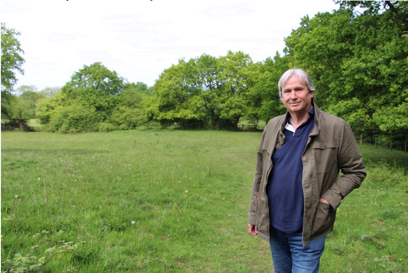
The fields around the church of St Kenelm, Romsley are ideal for a country walk, part of a Nature Reserve.

In contrast to many of our trips, this church is located only 30 minutes or so from Sedgley. It's in the Clent Hills in Romsley, close to Halesowen. Despite being near the urban conurbation, the church is set in a secluded site surrounded by beautiful countryside.