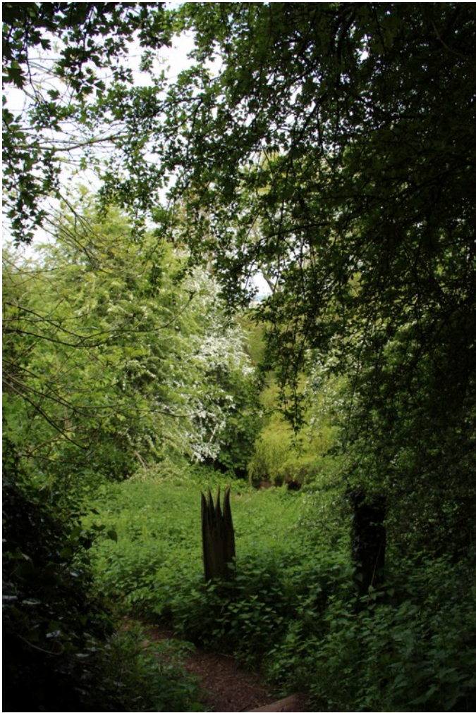
Leading from the churchyard there is a trail leading to a spring where St Kenelm was reputed to have been slain.