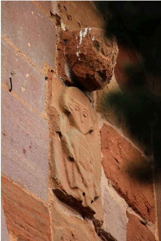
An effigy of St Kenelm on the south wall of the exterior of St Kenelm's.