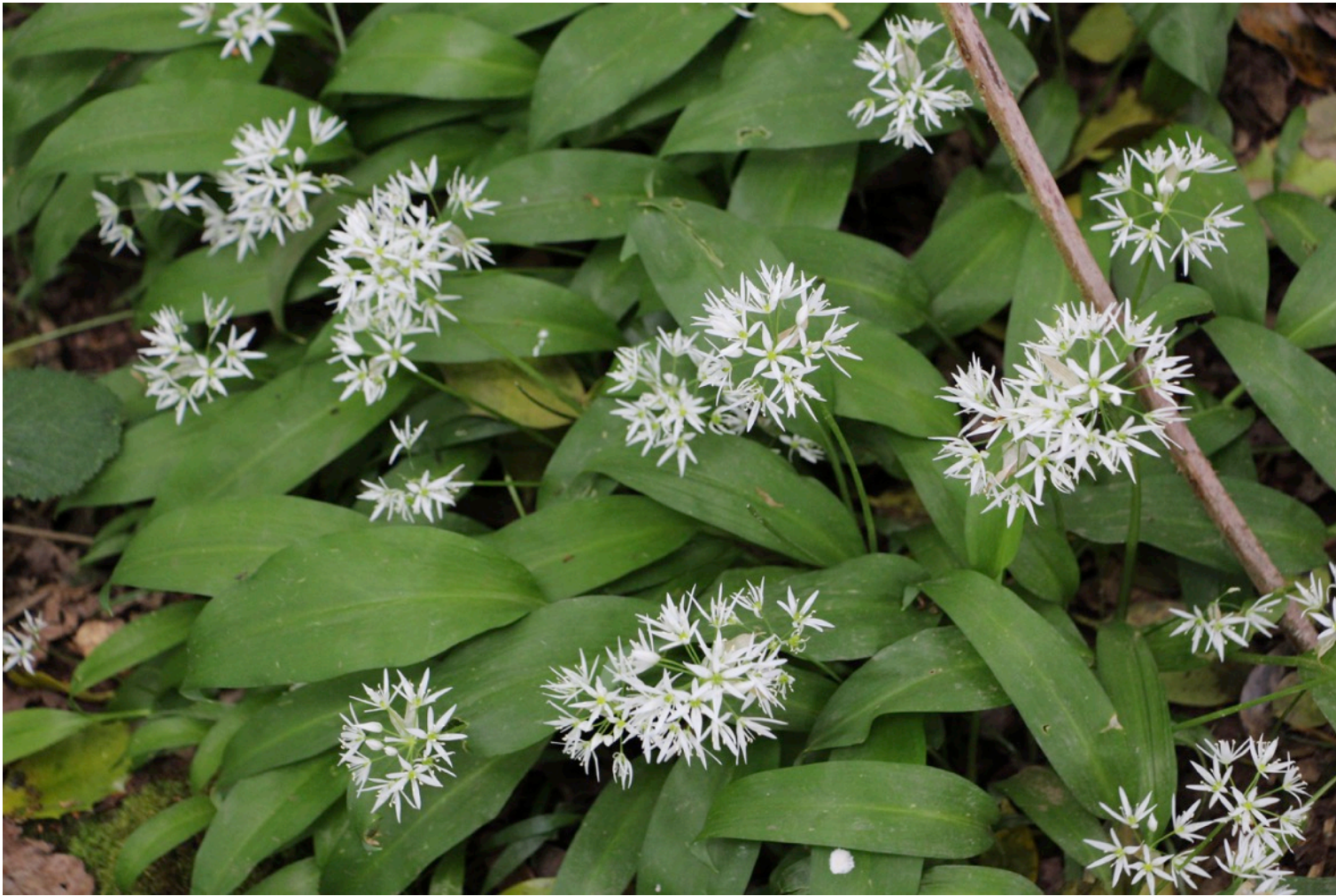
Flowers on wild garlic in the area around St Kenelm's spring.