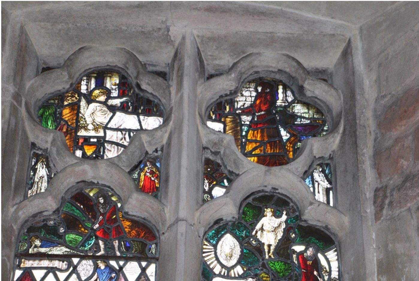
Detail from the north window. relating the legend of St Kenelm.

The legend of St Kenelm can be found here on the Britain Express site