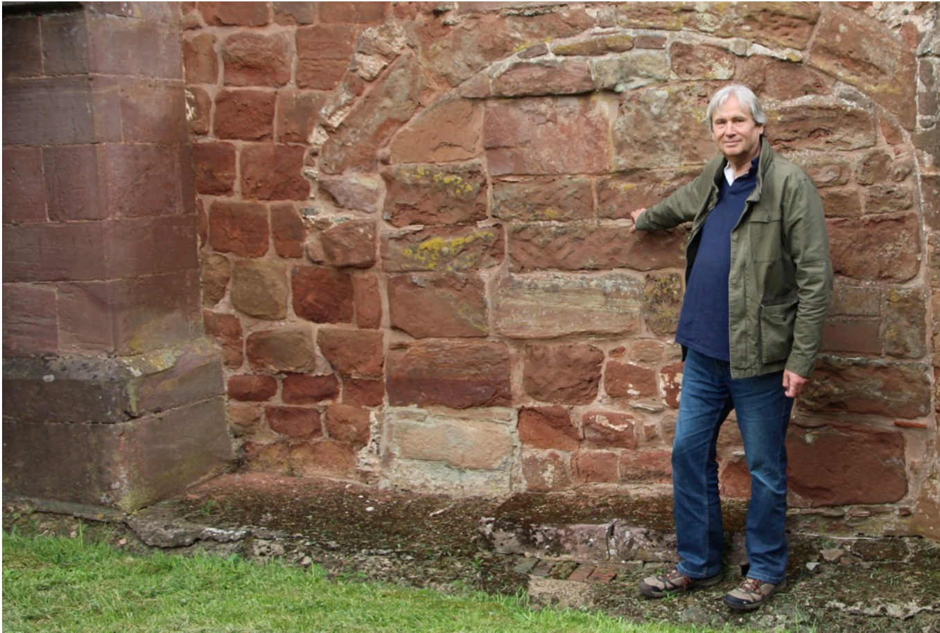
The blocked up entrance to the shrine of St Kenelm on the external wall at the east end of the church.

The fame of the church relies to some extent on the legend of a 9 th century boy king of England, who was lured to the location and murdered on the orders of his jealous sister. His body was later recovered by monks and taken to Winchcombe in Gloucestershire, which became a place of pilgrimage.