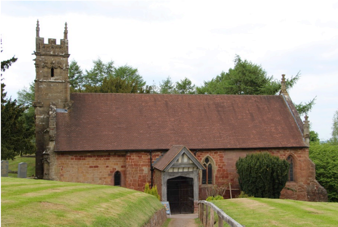
The beautiful approach to St Kenelm's Romsley.