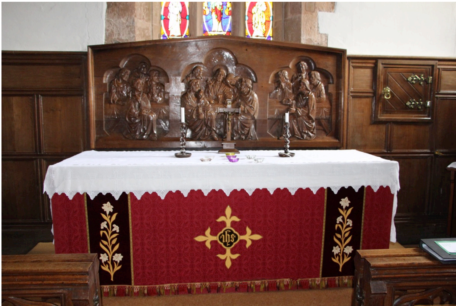
The beautiful altar and reredos at St Kenelm's Romsley.