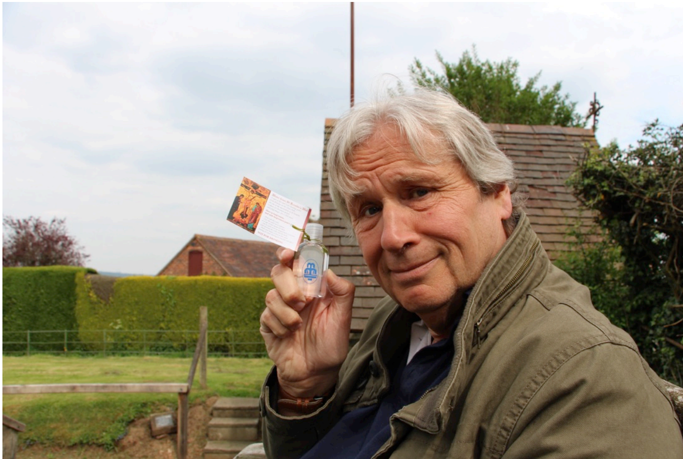
Holy water from the well at Romsley.