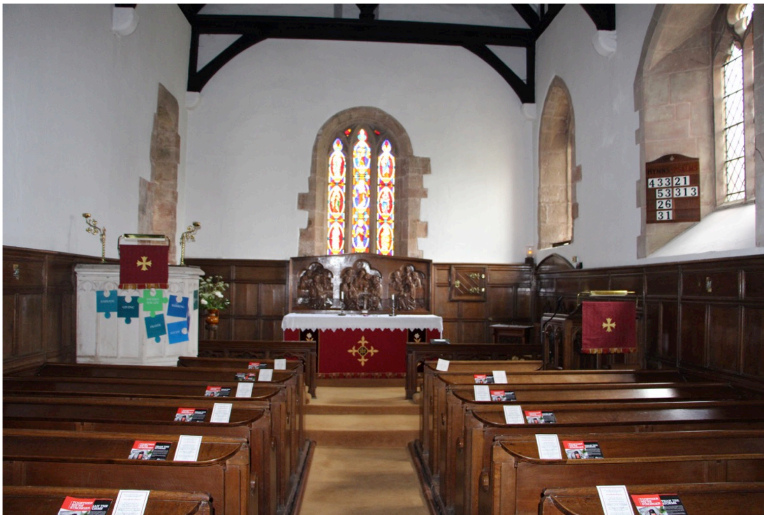
The all-in-one nave and chancel at St Kenelm's, Romsley.