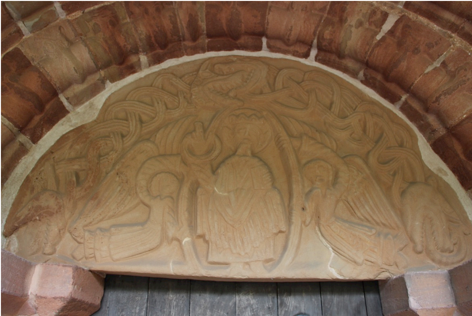
The tympanum above the front door to the church of St Kenelm at Romsley.