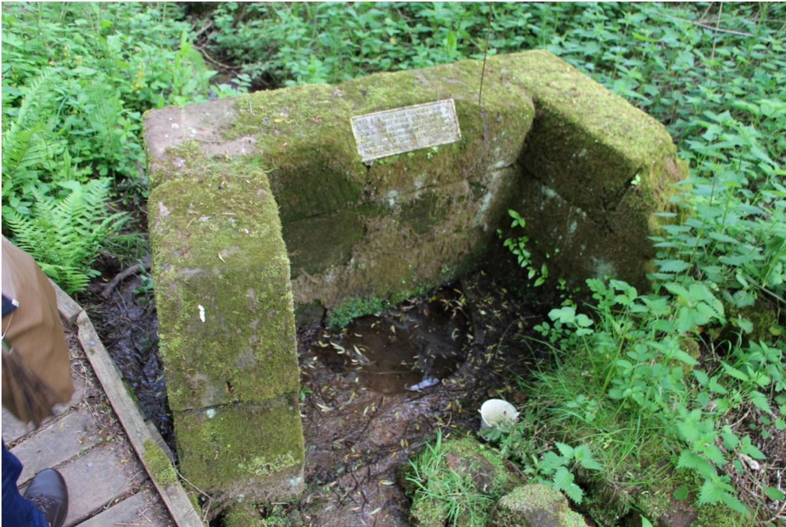
The Victorian monument to the legend of St. Kenelm.