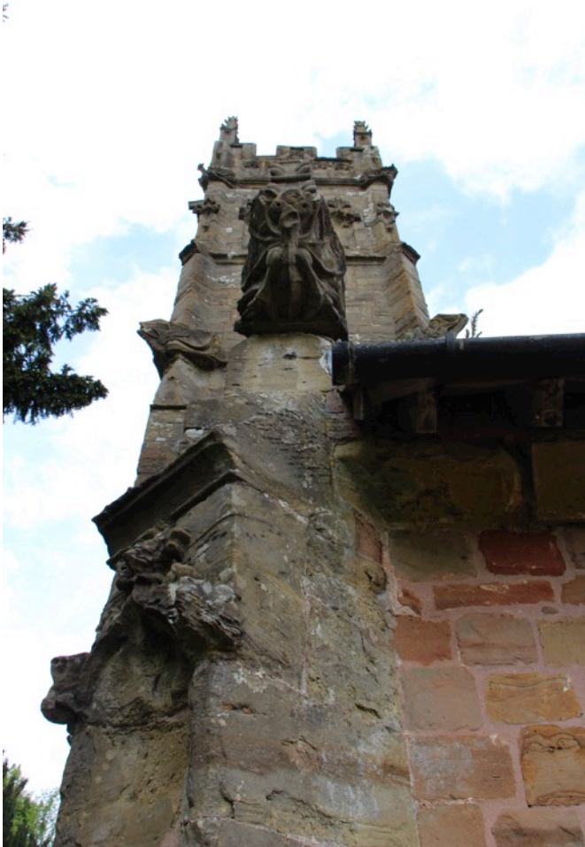
The present church was built in the 14 th century; however there are Norman features retained in the architecture.