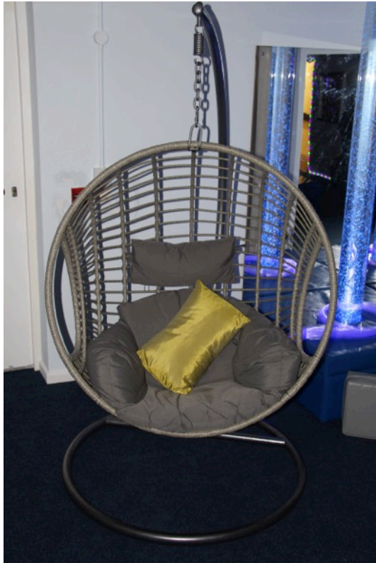
The suspended wicker chair in the Sensory Room.