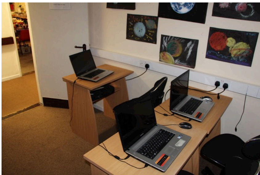
The computer room.

The dining room walls have been decorated in dynamic grey and white stripes by one of the members, with help from the centre's support staff. The idea is to give members lots of different experiences and thereby provide opportunities for them to excel.