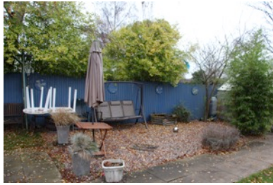
The sensory garden.