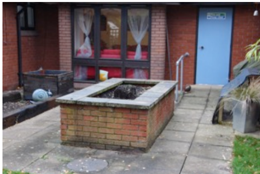
Raised beds outside for growing vegetables, which are cooked to make meals for the members.

Alas currently the centre has no one to lead the woodworking activity and are actively looking for someone – they would not have to supervise the members, because High Flyers' staff undertake that.