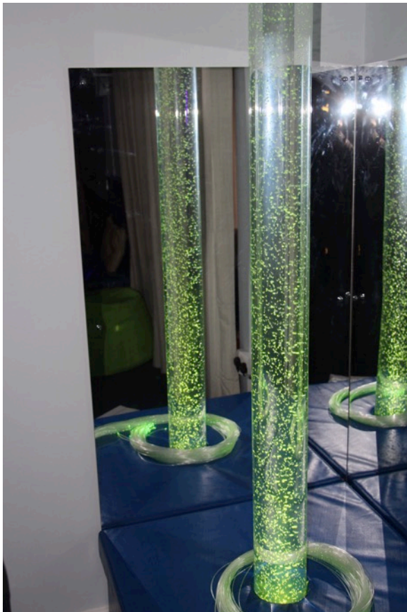
Infinity tubes in the Sensory Room change colour.