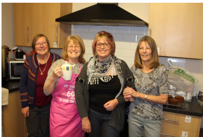
Volunteers in the kitchen- three of whom are parents of members.

The premises used to be a Mencap residential home, but High Flyers have altered it considerably to accommodate their activities.