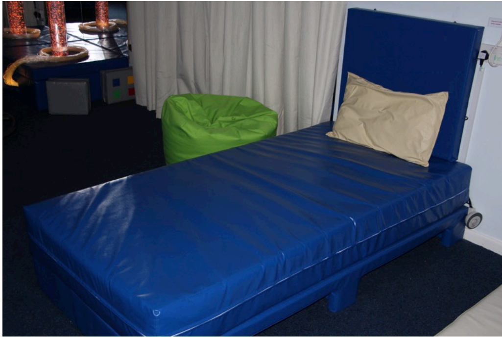
The water bed in the Sensory Room.