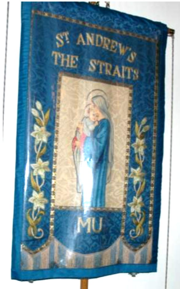
The St. Andrew's Mothers' Union Banner

A Mothers' Union banner hangs on the back wall between the two corner Altars. The MU is still active at St. Andrew's and is merged with the MU at All Saints' for meetings and activities.