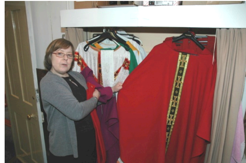
(Left) A purple chasuble worn during Advent, Lent, Requiems and other penitential occasions when the Holy Eucharist is to be celebrated. (Right) A red chasuble, worn on days commemorating Martyrs. On the Patronal Festival, St Andrew's Day, this chasuble is worn.