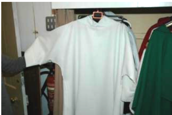
An alb in the vestry. An alb is a Eucharistic vestment, usually worn over a cassock and under a Chasuble. In the Church of England, Albs are worn for all Eucharistic services.