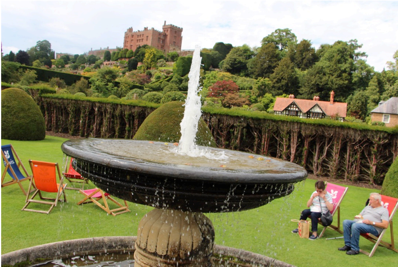
The lower level of the castle has a beautiful fountain, what remains of an extensive 17 th century Dutch water garden. 'National Trust' deck chairs are laid out in groups for the convenience of visitors in the summer months.