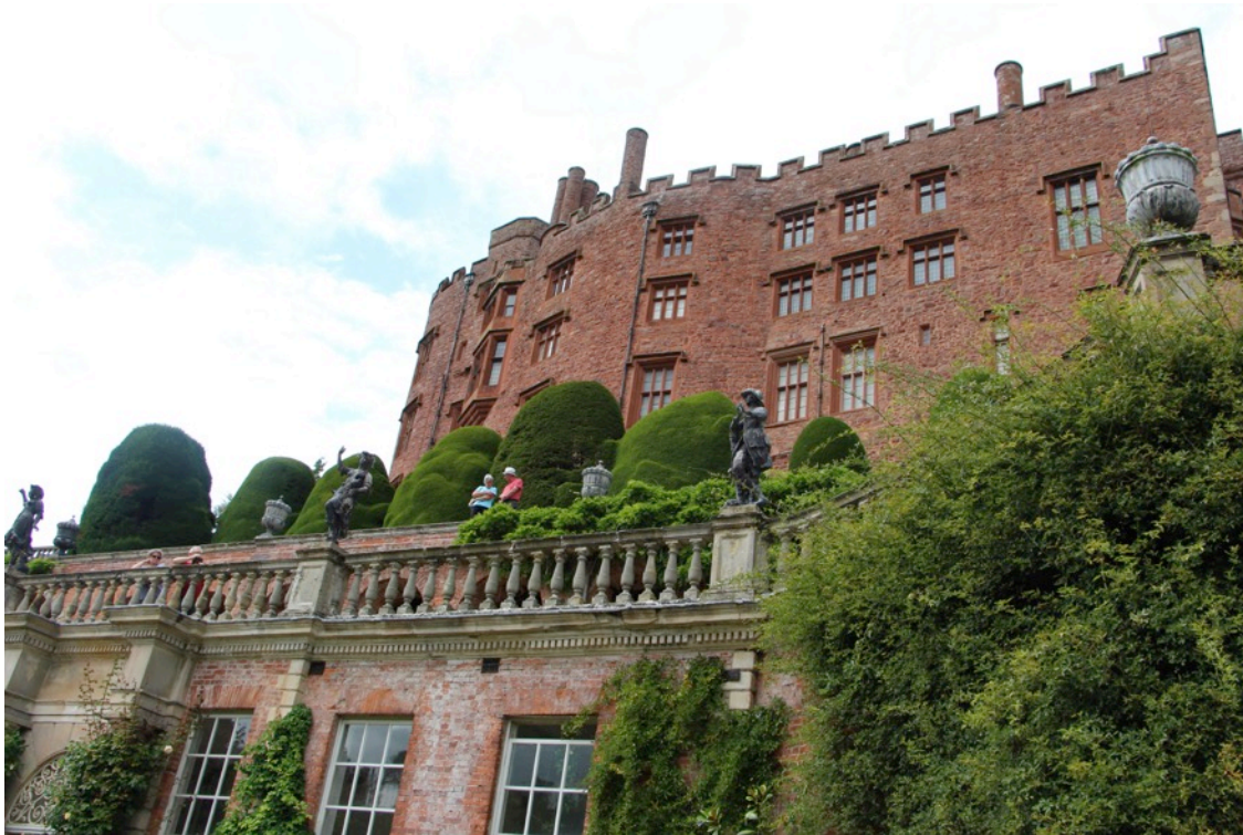
The Italianate terraces of Powis Castle.

Following the end of the Welsh Wars (1282) and for his loyalty to Edward I , the King permitted a Welsh prince, Gruffydd ap Gwenwynwyn to begin building Powis Castle circa 1283.