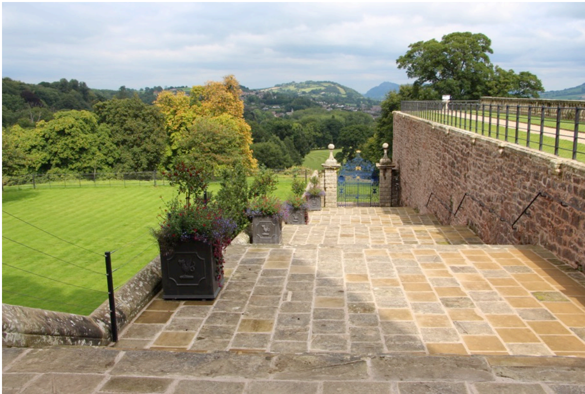
The impressive Powis countryside viewed from the castle.