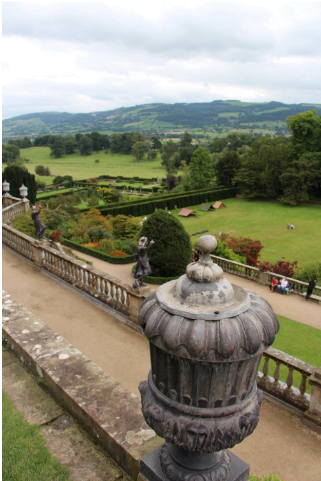
A view of the Powys countryside from the Italian Renaissance-influenced flower terraces containing statues. When we visited, the grassed area in the distance was being used for children's activities.