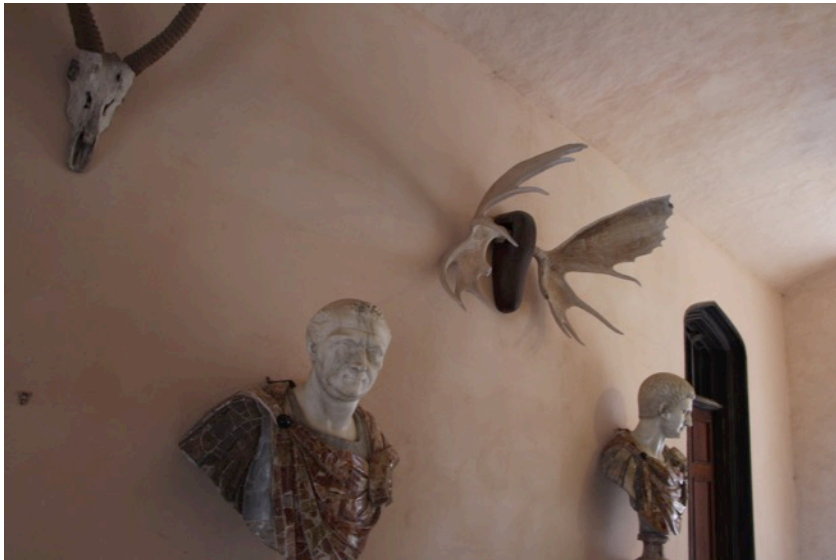
The 'gallery of the Caesars' at Powis Castle.

Edward also worked in the East India Company and was then the Governor of Madras . His marriage to Henrietta led to the union of the Clive and Powis estates in 1801, and in 1804 the earldom of Powis was recreated for the third time for Edward Clive.