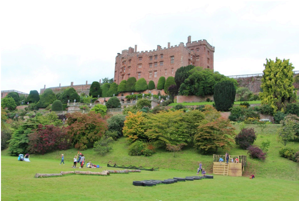
The castle with its terraces, filled with well stocked flowerbeds and dramatic, beautifully maintained topiary.

We visited Powis Castle in late August 2017. It's a medieval castle, built by a Welsh prince in the 13 th century near Welshpool, in Powys, Wales but later turned into a grand mansion. It's best known for housing the treasures that were brought home by Robert Clive and his son, Edward Clive from India. They were collected during their time working for the East India Company .