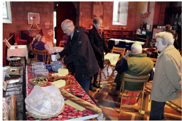
The Lenten lunch we shared with parishioners at St James the Great, Cradley.

When we arrived at Cradley church we were greeted by one of their church volunteers, who showed us round and invited us to stay for a Lenten Lunch with other parishioners. We received a very warm welcome and enjoyed their home made soup, bread and cheese.