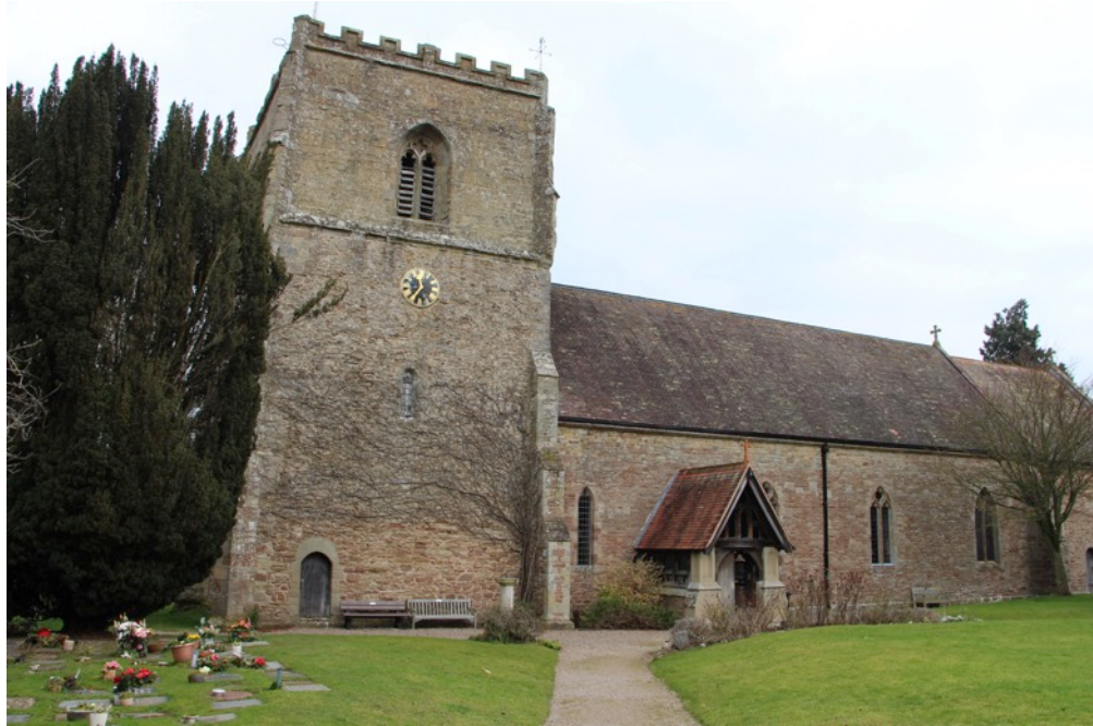
St James's Church, Cradley, Herefordshire.

Our first visit was to the beautiful St James's Church in the village of Cradley, Herefordshire, which is 4 miles northwest of Great Malvern.