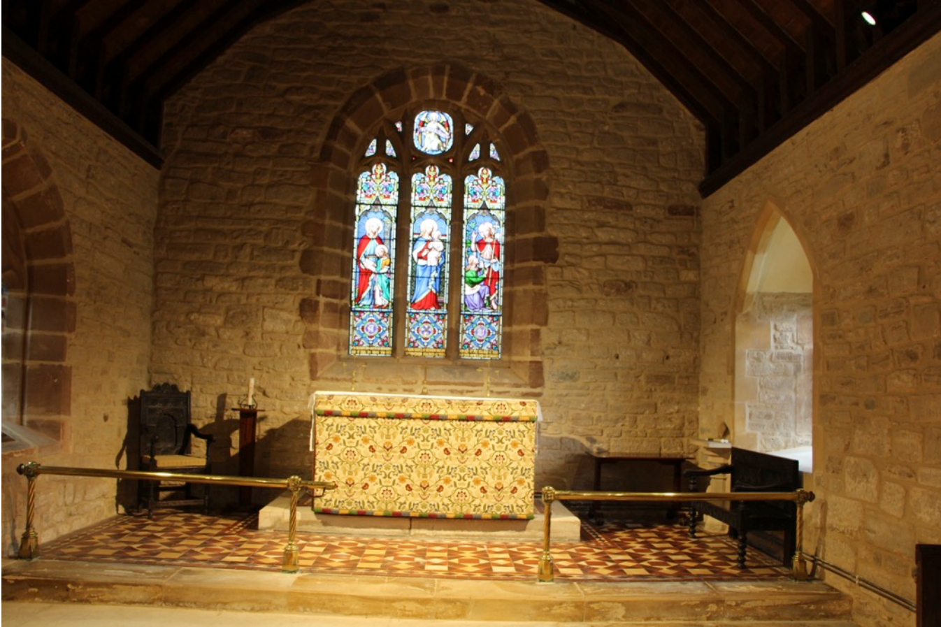
The 14<sup>th</sup> century chancel at St Faith's Berrow, which has benefited from a sensitively executed restoration.

The Restoration Project at St Faith was completed thanks to the generosity of individual donors, the Church Commissioners and Heritage Lottery Fund , with a grant of almost £100,000 under the Listed Places of Worship Scheme. It needed urgent work for damp, improved lighting, adaptation for community use and some damaged areas needed repair.