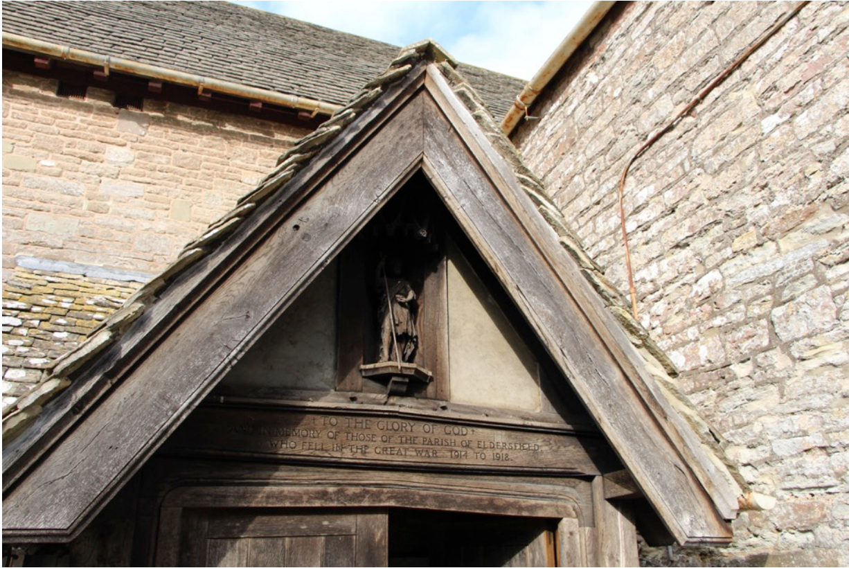
War memorial porch at St John the Baptist, Eldersfield, Diocese of Worcester.

Lenten Journey - Malvern and surrounding area Part 3 – Eldersfield, Pendock and Berrow