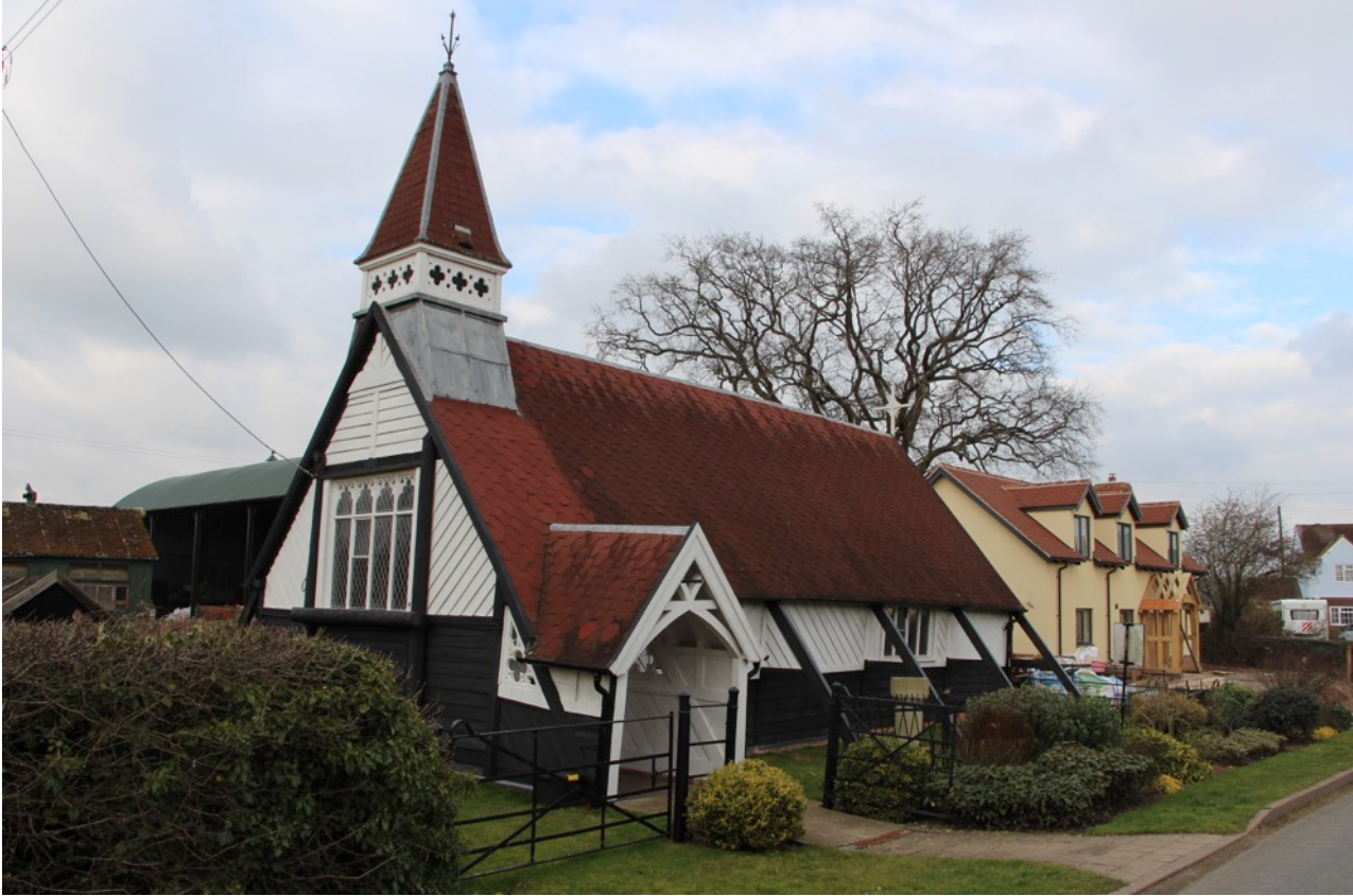
Pendock Cross Church. The font can be seen in the garden to the right of the porch.

There was however another church in Pendock - Pendock Cross Church also in the Diocese of Worcester. More bad luck - it was again closed! However it was a very attractive and unusual church. It resembled a Mission Church (rather like St Andrew's The Straits) - made entirely of wood. Also known as The Redeemer Church, it was built in 1899 as a temporary mission church, but is still in use. It has an outdoor font, which is stacked up on bricks. Again, alas, we had no opportunity to collect a leaflet.