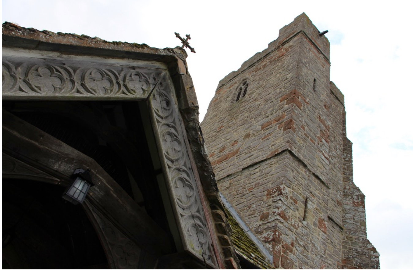
The porch and church tower at St Faith's, Berrow.

The tower of St Faith's was probably built in the 15<sup>th</sup> century. It's unusual for being rectangular. Faith or 'Foy' , to whom the church is dedicated, was a young French girl from Aquitaine who died for her faith at the end of the 3<sup>rd</sup> century.