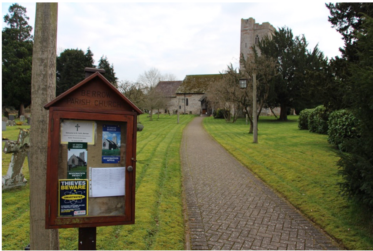
St Faith, Berrow in late February – the churchwarden was busy mowing when we arrived, but still found time to welcome us!

Our next port of call was altogether more successful. St Faith in Berrow was not only open, but extremely welcoming. When we arrived the churchwarden was himself undertaking the year's first mow of the churchyard. He very kindly told us about all the work that had been done to restore the church, with the assistance of the Heritage Lottery Fund.