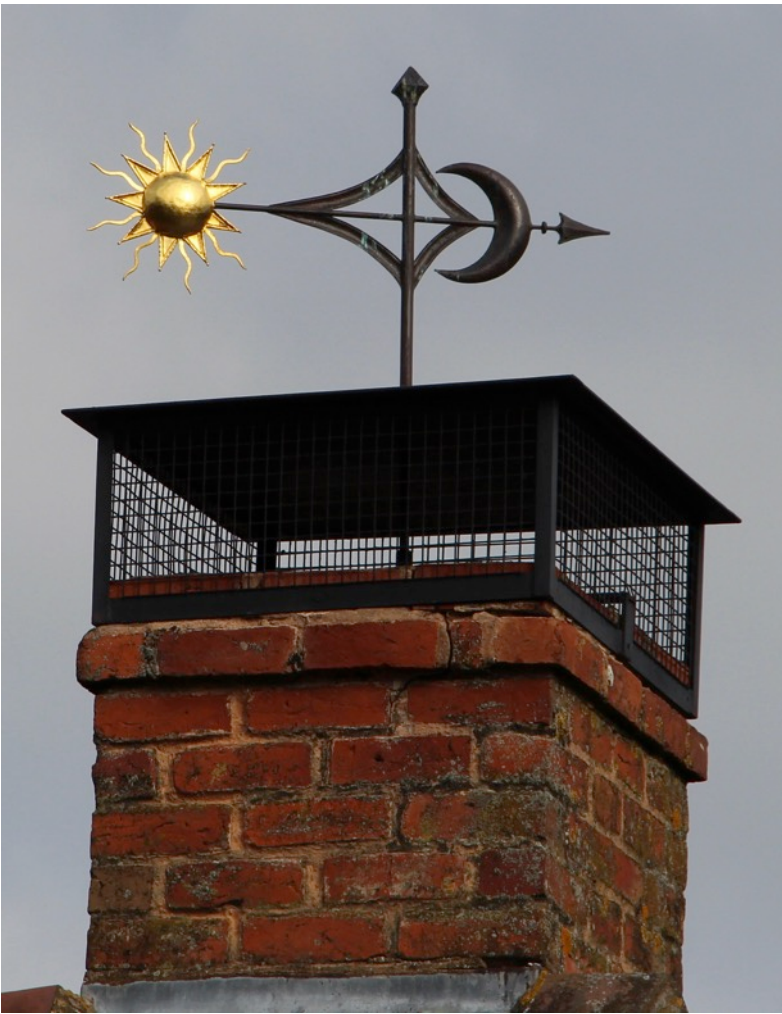
An unusual 'sun and moon' weather vane on the steeple at St John the Baptist, Eldersfield.